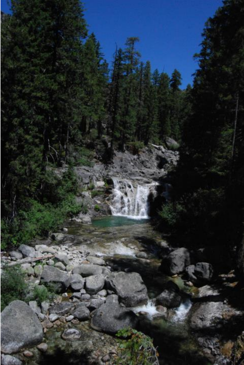
Lower Falls on Canyon Creek